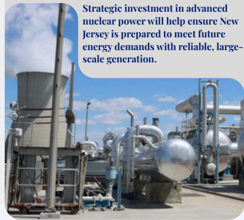
Strategic investment in advanced nuclear power will help ensure New Jersey is prepared to meet future energy demands with reliable, large-scale generation.