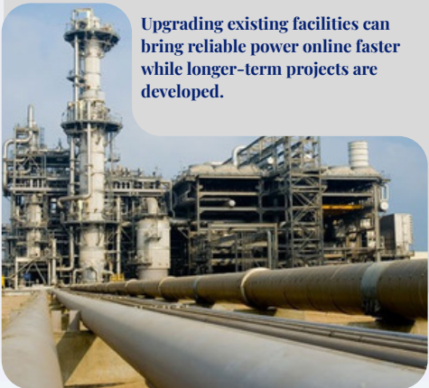
Upgrading existing facilities can bring reliable power online faster while longer-term projects are developed.