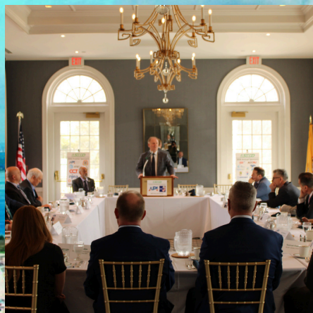
Hope Creek Nuclear Generating Station

By prioritizing smart planning, modern technology, and ongoing infrastructure investment, New Jersey can keep its energy systems reliable, resilient, and ready for the future.